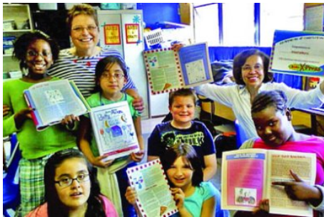
4 County Organizations Making a Difference