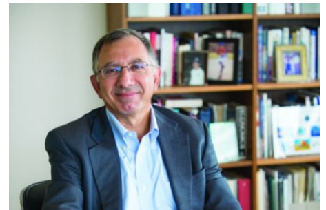
Tales of Business Expansion in Westchester