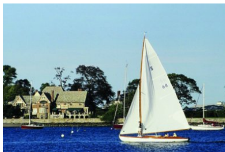
Guide to the Outdoors in Westchester