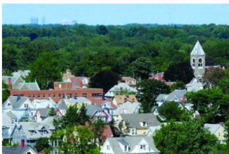
Resources For Businesses & Services in Westchester