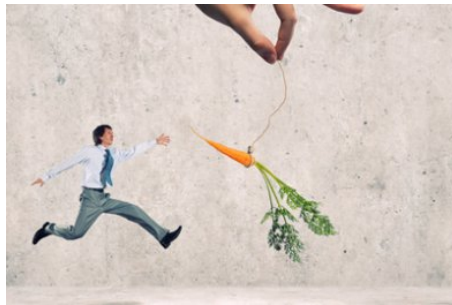
3 Westchester Companies Dubbed Best Companies to Work for in NY