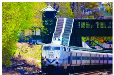
Guide to Getting Around in Westchester